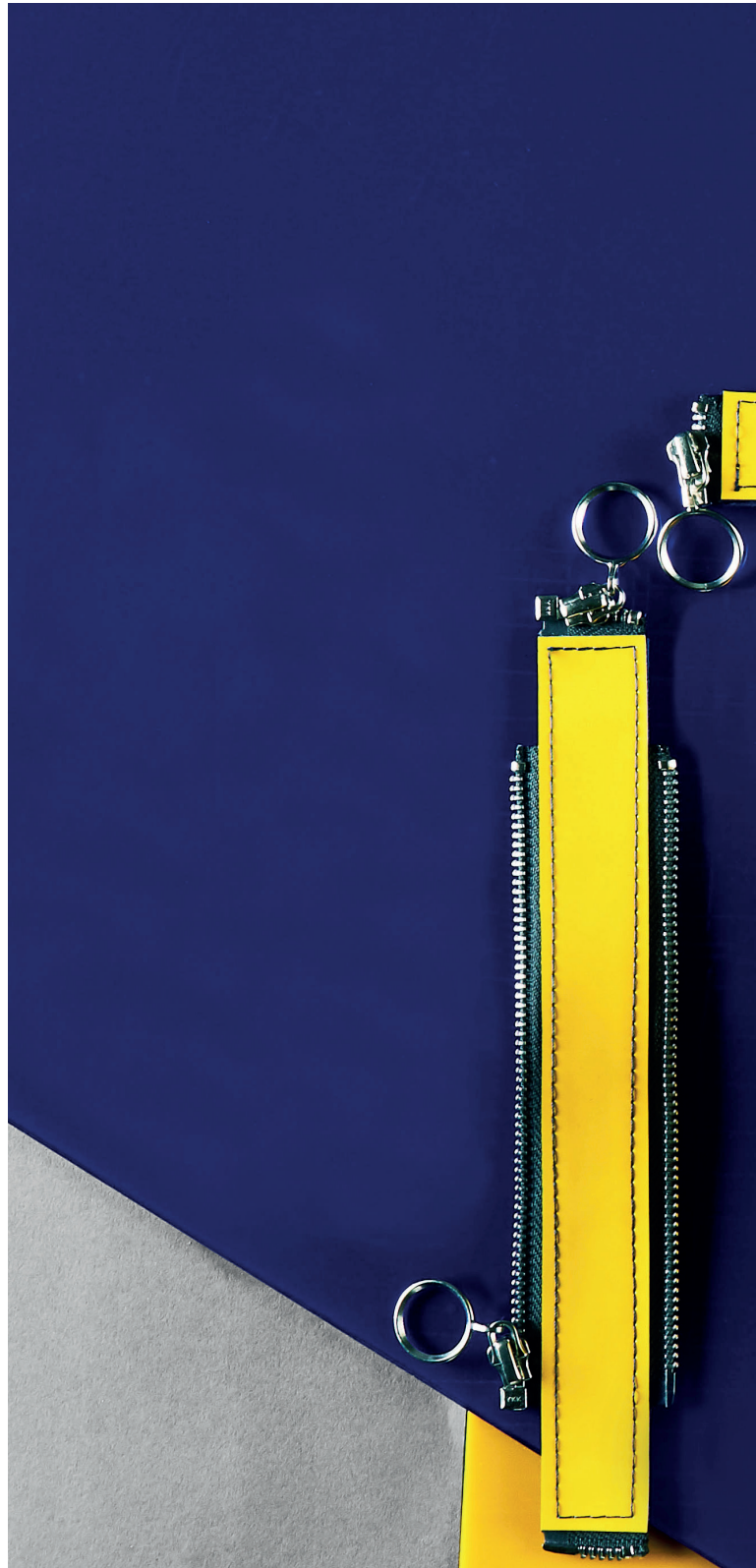
Ioanna Rafaella BA (Hons) Fashion Accessory Design 2017

ravensbourne.ac.uk/outreach @RavensbourneWP #OurRavensbourne outreach@rave.ac.uk