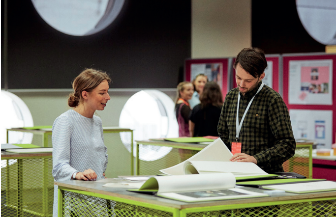
Fashion lookbooks at the Degree Show 2017