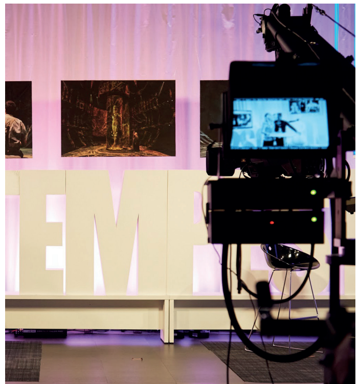
BSc (Hons) Broadcast students supporting The RSC