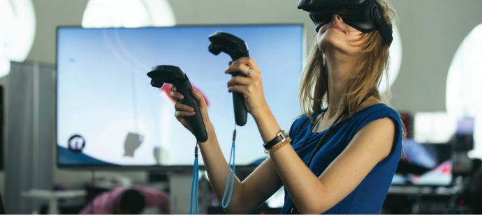
Virtual Reality project at the Degree Show 2016